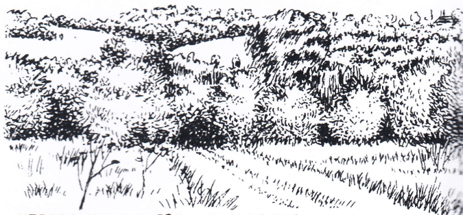
OTFORD MOUNT FROM PALACE PARK WOOD

8. Follow path by Castle Farm and into Church Car Park. From church, retrace steps to Car Park.